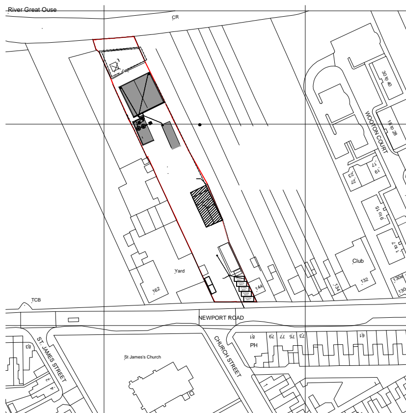
Site Location Scale: 1:1250